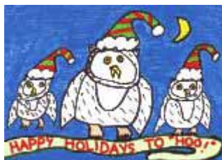
Cards from Make-A-Wish were designed by four Make-A-Wish children.

Here's a sampling of other charities offering holiday cards: